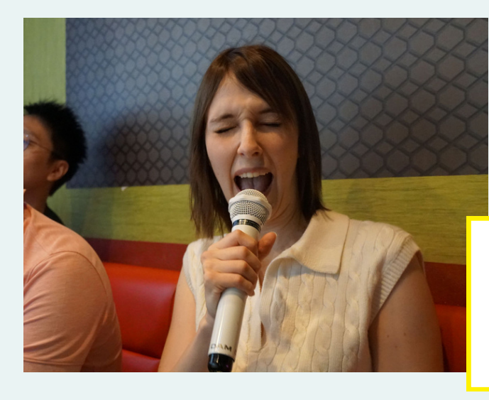
Monday, Feb 10th Let's enjoy karaoke together <1,400 JPY >